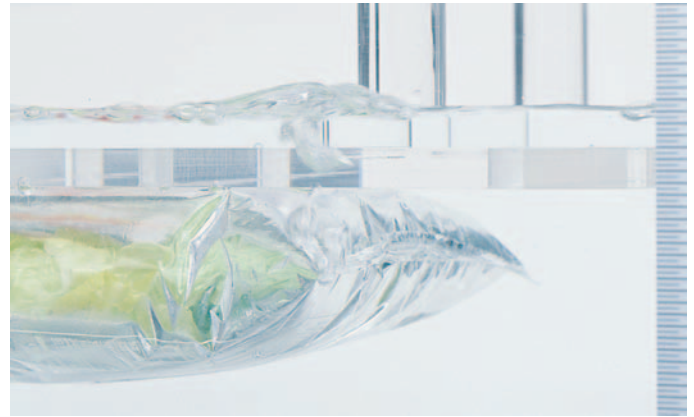
The Pack-Vac’s clear tank provides 360° viewing. A telltale stream of bubbles will rise from a leak.

“Consistent shelf-life for our packaged jerky products has allowed us to extend our market reach. The Pack-Vac helps us guarantee the freshness of our delivered goods.”